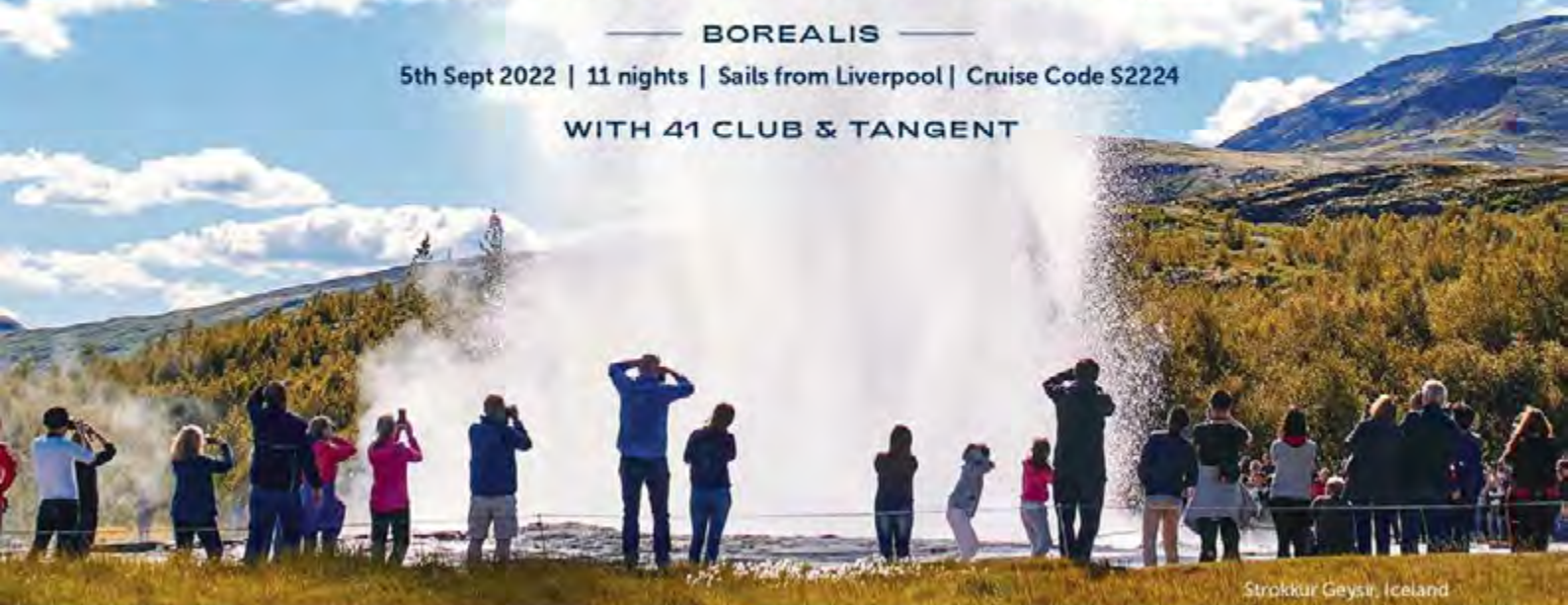
Strokkur Geysir, Iceland

You're in for an unforgettable adventure, as you go in search of the wonders and wildlife of Iceland and the Faroe Islands. From Reykjavik, journey to witness the natural power of the Gullfoss Waterfall and gushing Geysir hot springs. From Akureyri go whale watching in the northern waters to look out for humpback and minke whales, dolphins and porpoises.