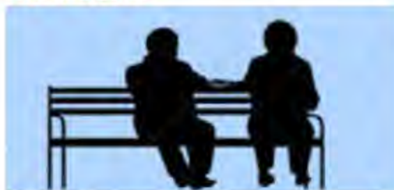
Two old codgers sitting on a bench overlooking the River Medway.